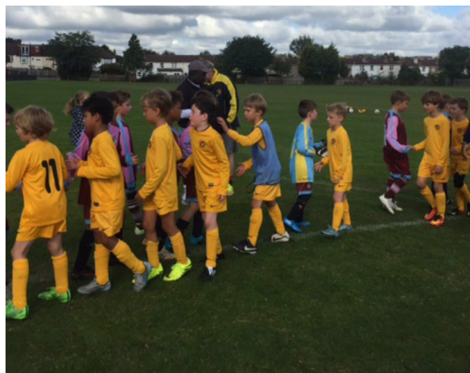
Merton FC U9s: both sides showing good sportsmanship