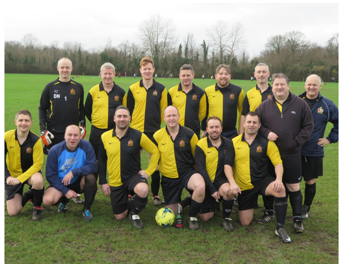
Merton FC & Old Westminster Citizens Vets: before their encounter in 2015