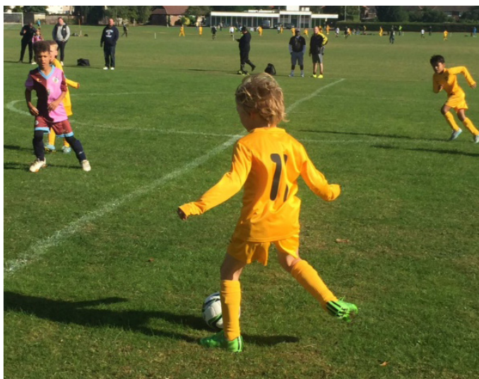
Merton FC U9s: controlling the game from the start