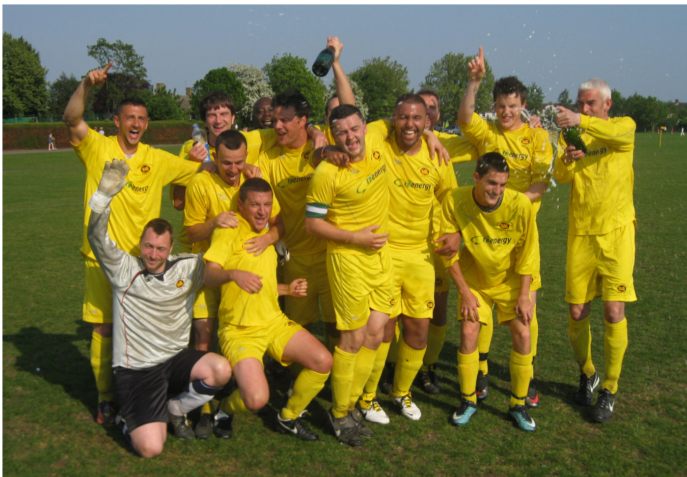
Merton FC 3s: not too sure what they're celebrating