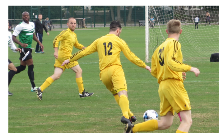
Merton 3s: on the attack