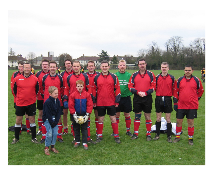
Merton FC 4s: an athletic bunch