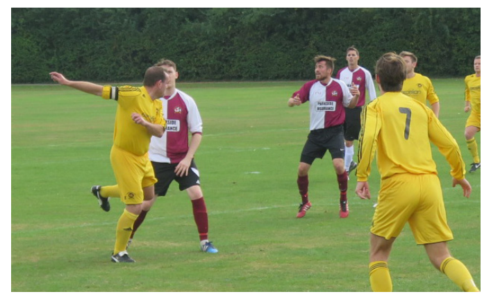
Mertons 1s: on the ball