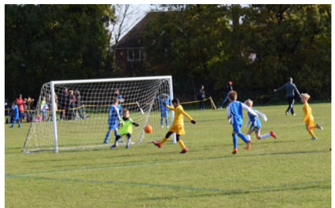
Merton U9s: top bins