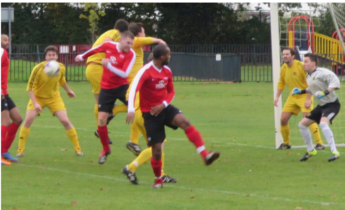
Merton 2s: on the defence