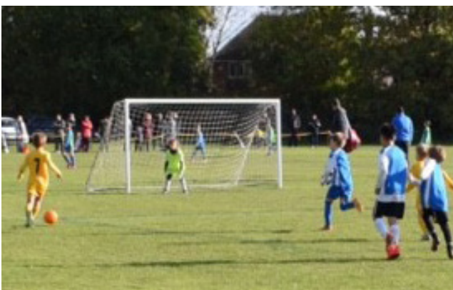
Merton U9s: in on goal

Please come and support the under 9s this Sunday.