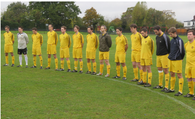
Merton 2s: minute's silence for Armistice Day