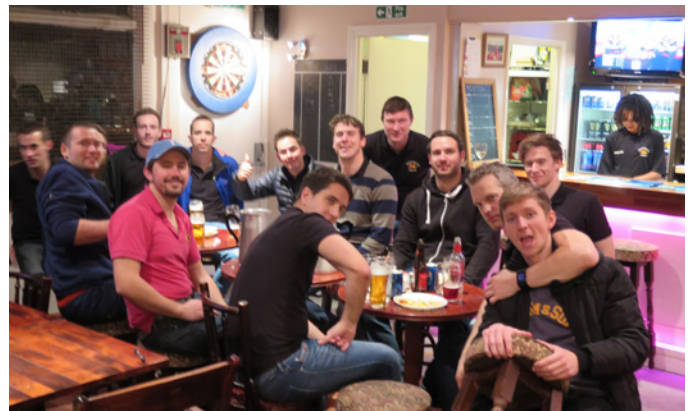
Merton 2s: hard earned point enjoyed in the bar