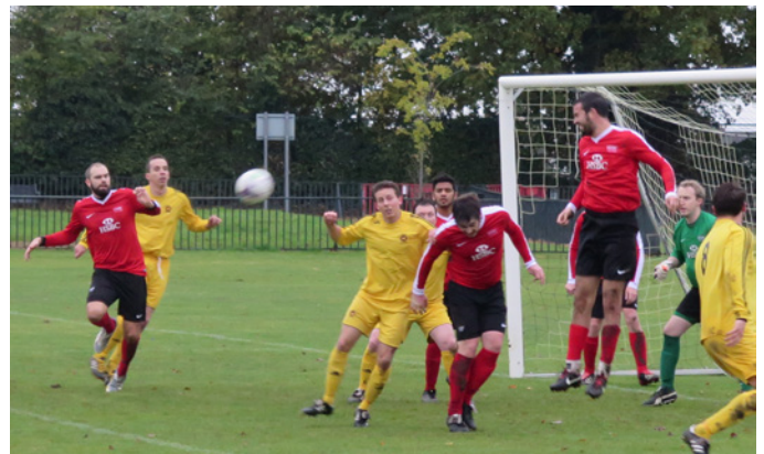
Merton 2s: on the attack