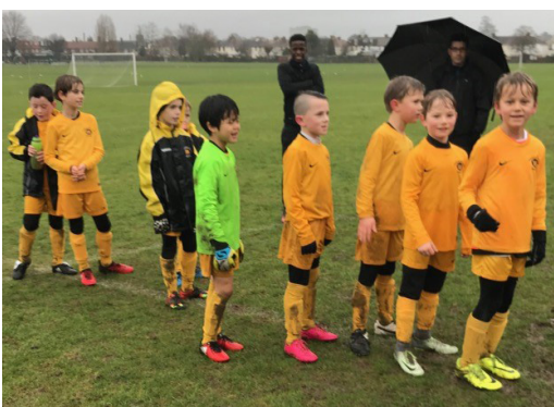
Merton U9s: We are not wet or cold!!!