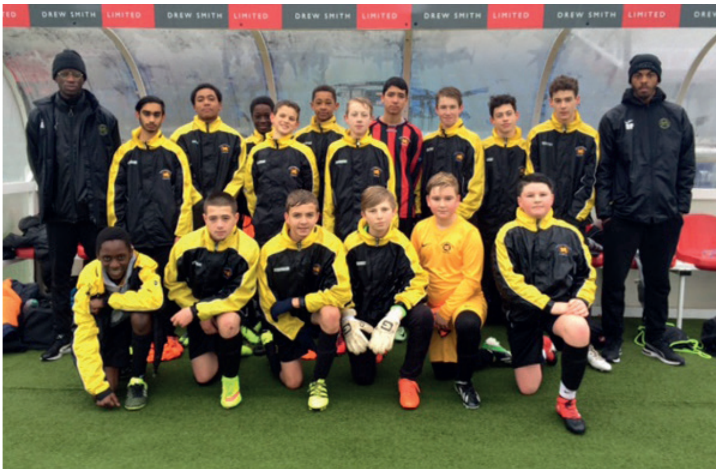
Merton 14s: Line-up in the dugout at Sutton United