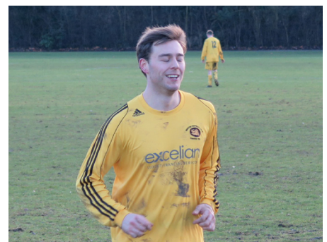
Merton 1s: left to right: the undersoil heating on the blink so all hands on deck; someone's only got one foot or boot; a happy first team