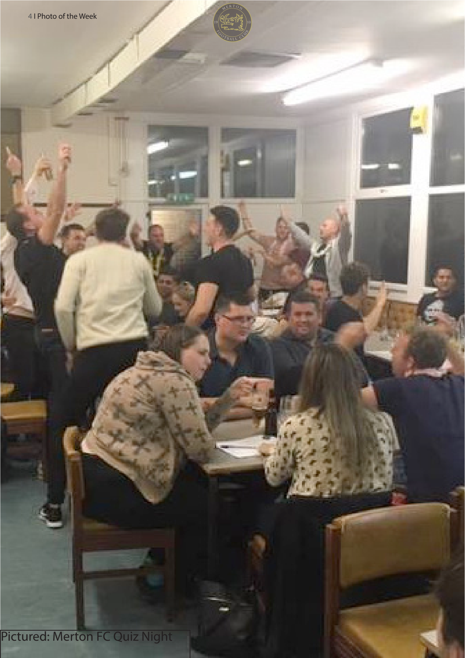
Pictured: Merton FC Quiz Night