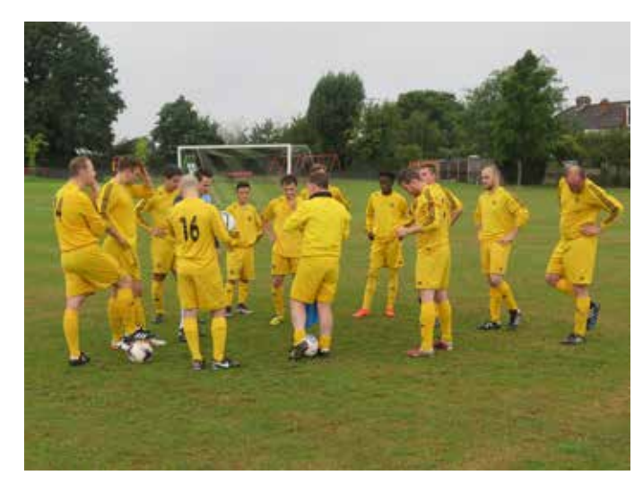
Merton 2s: getting to know each other and teamtalk