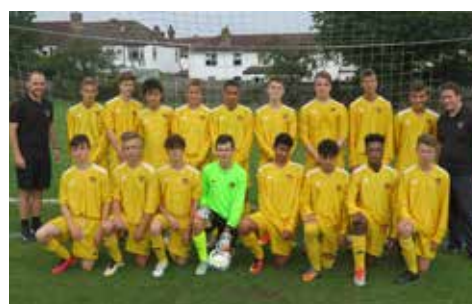
Merton U15s: team line-up at the Hood