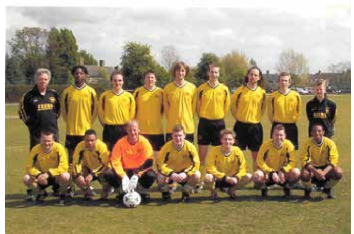
Merton FC: back in the day when players looked like footballers