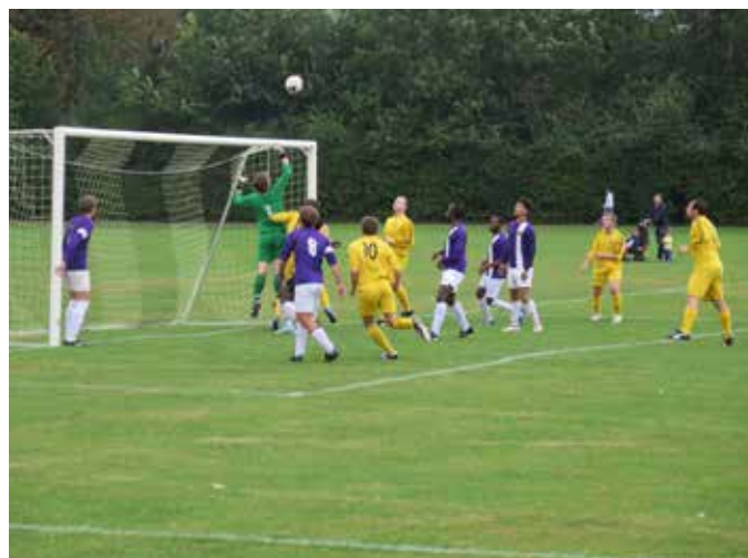
Merton 2s: one of the number of attacks on Oldsmiths' goal