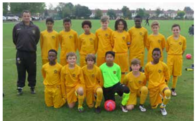
Merton U13s: team line-up at the Hood