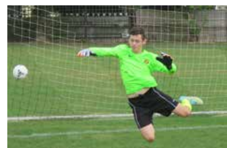
Merton U15s: before going off injured