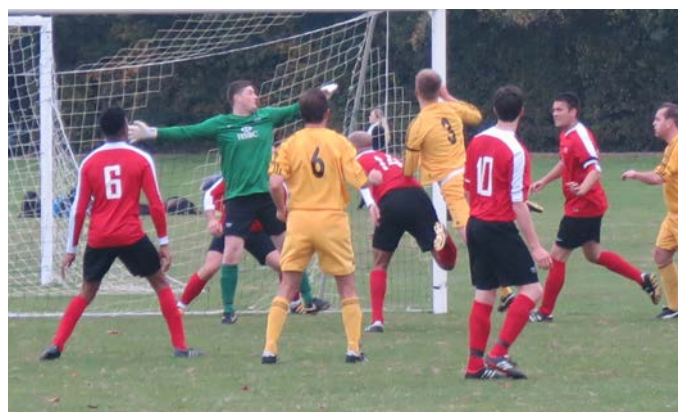
Merton 1s: another attack in vain