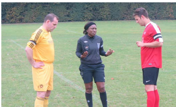
Merton 1s: are both skippers getting told off?