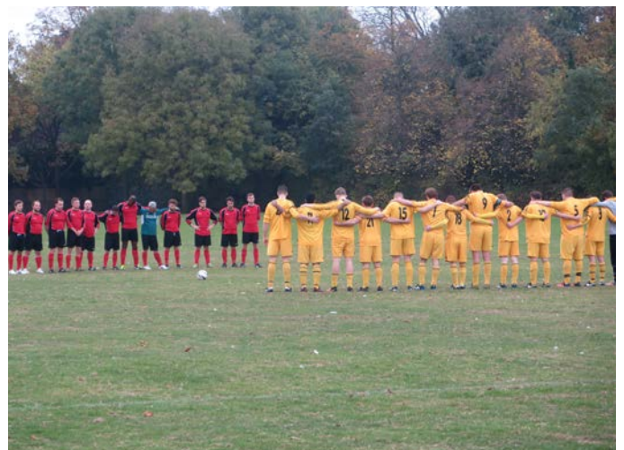
Merton 4s: both sides pay their respects