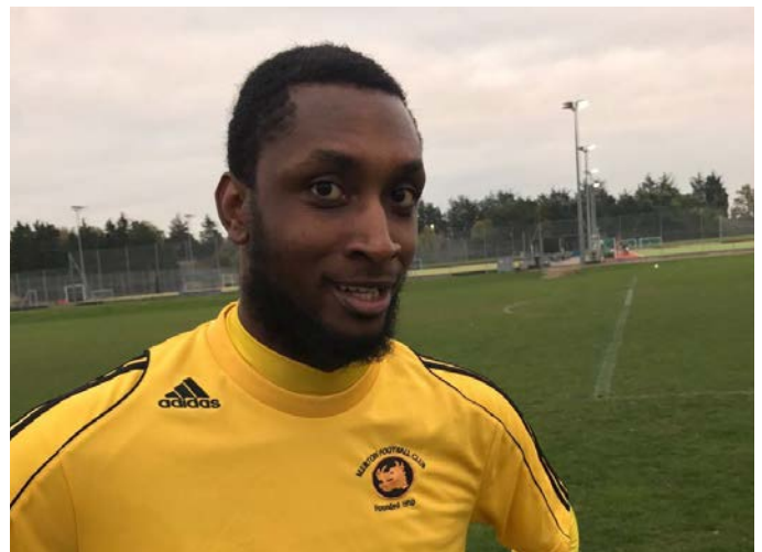
Merton 5s: Dulanie doubles up