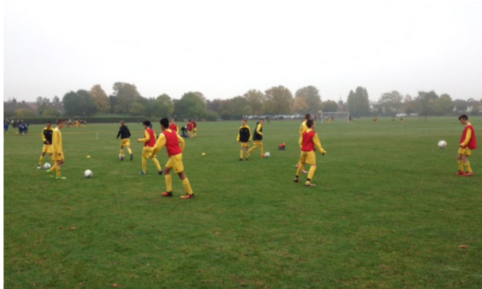
Merton U15s: warming up on a foggy Sunday morning