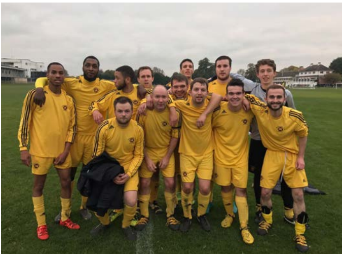
Merton 5s: what a fine bunch