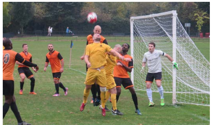
Merton 3s: Yellow boar's downed by men in orange