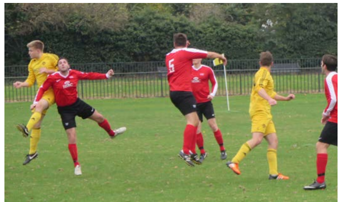
Merton 1s: spot the ball competition