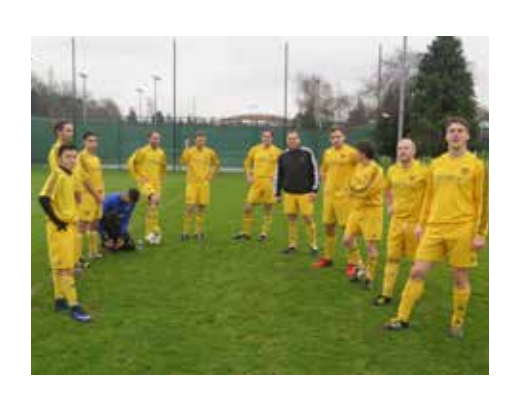
Merton 1s: go through a strenuous warm-up before taking on Bank of England