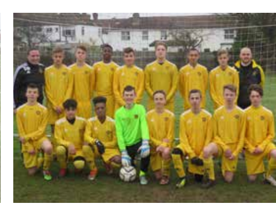
Merton U9s Merton U13s Merton U15s

he Youth section is thriving. The teams are well managed and organised with lots of motivated players and parents. The challenges in Youth football are slightly different to those facing the adult club and child safeguarding and parental discipline are the two hot topics in youth football which are being gripped with closer vigilance at FA, County, League and club level.