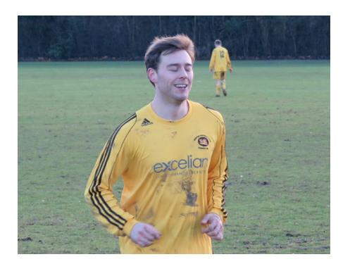
Merton 1s: left to right: the undersoil heating on the blink so all hands on deck; someone's only got one foot or boot; a happy first team