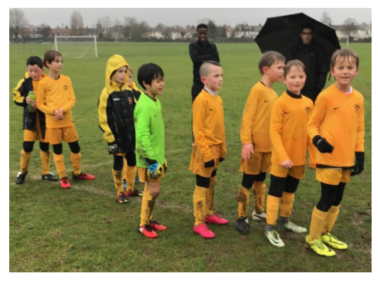
Merton U9s: We are not wet or cold!!!