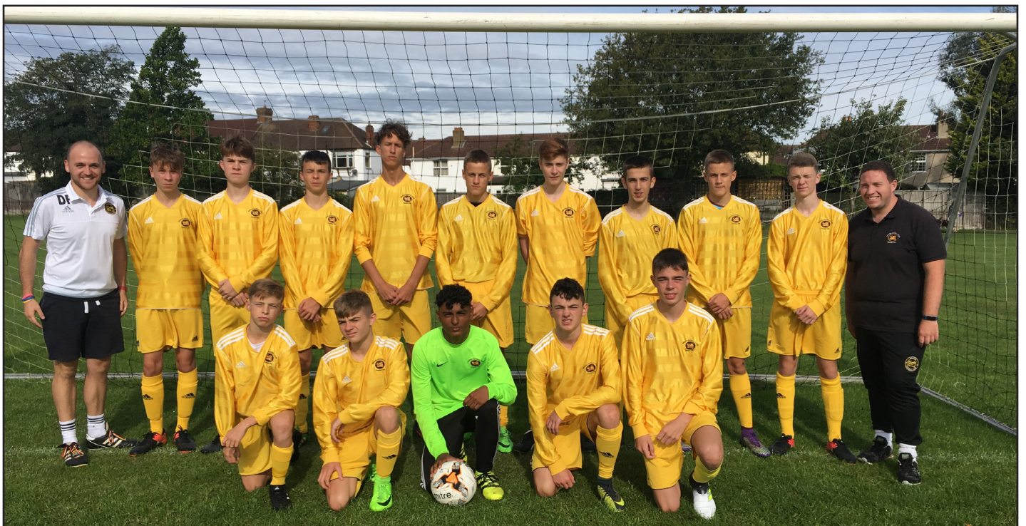
Pictured: U-16 Team photo

Despite the disappointment of not winning, we take a point from a team that came from division above.