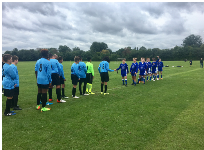
Pictured: u-14's shake hands with worcester park colts before game.

GOALSCORERS: FAREED (3) JUSTIN (2) KIERON (1) THEO (1)