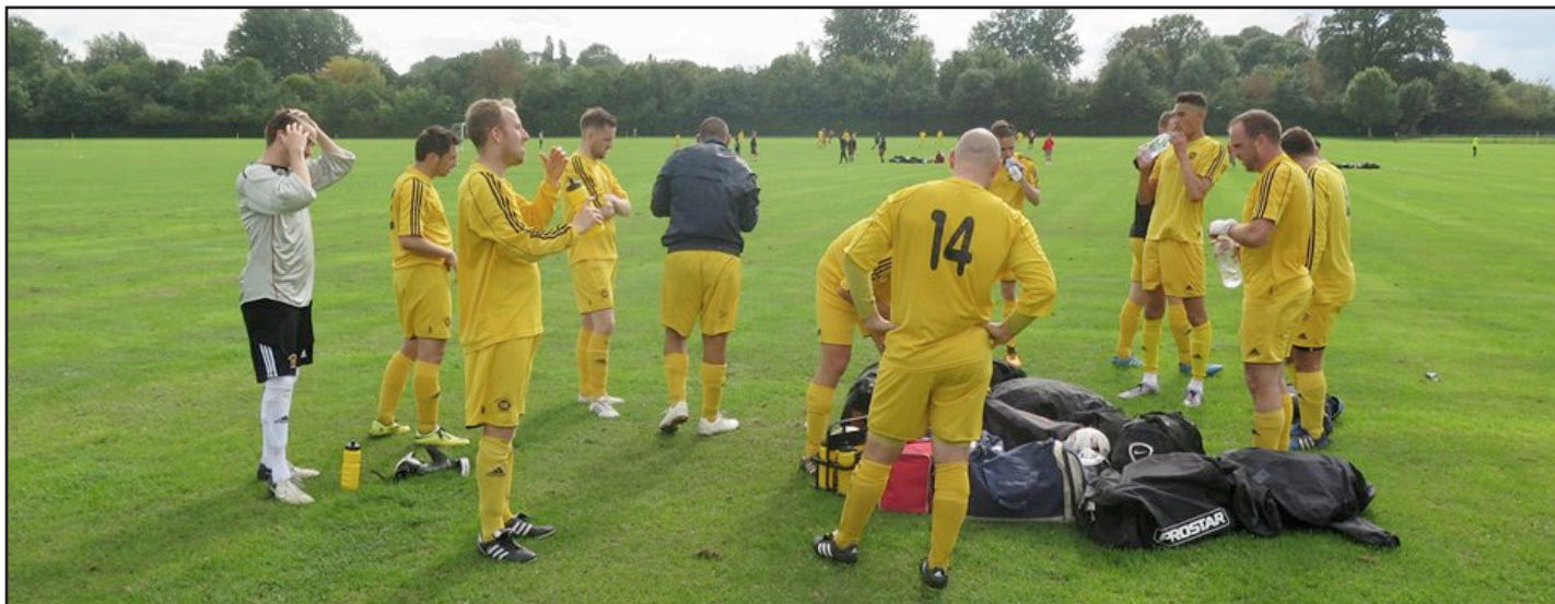
Pictured: 2's Half-Time team talk