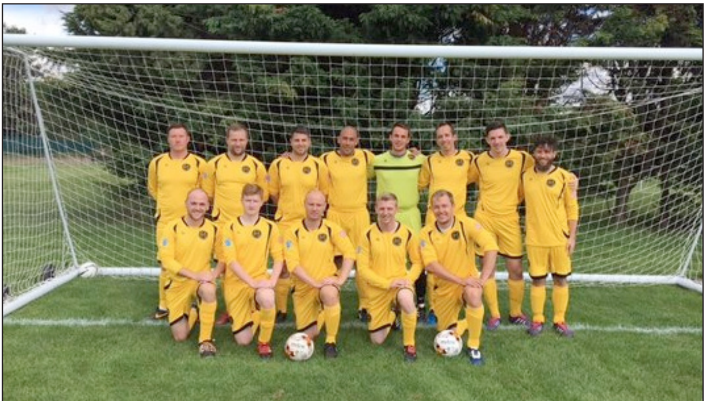
Pictured: 3's in their kit first game of the 2017-2018 season.

A lot to learn and a lot more to forget from this performance. Onto next week to really get the season going!