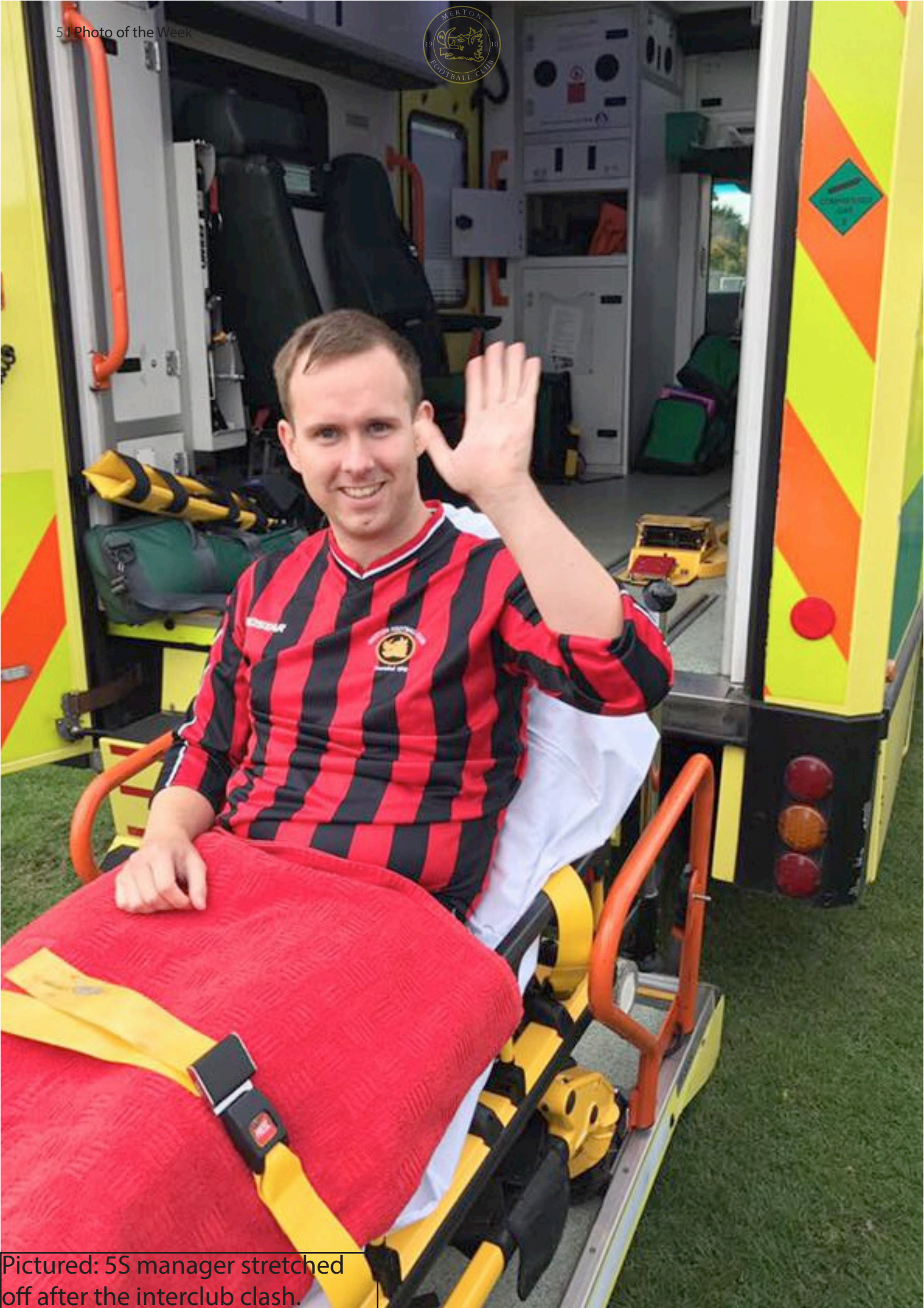
Pictured: 5S manager stretched off after the interclub clash.